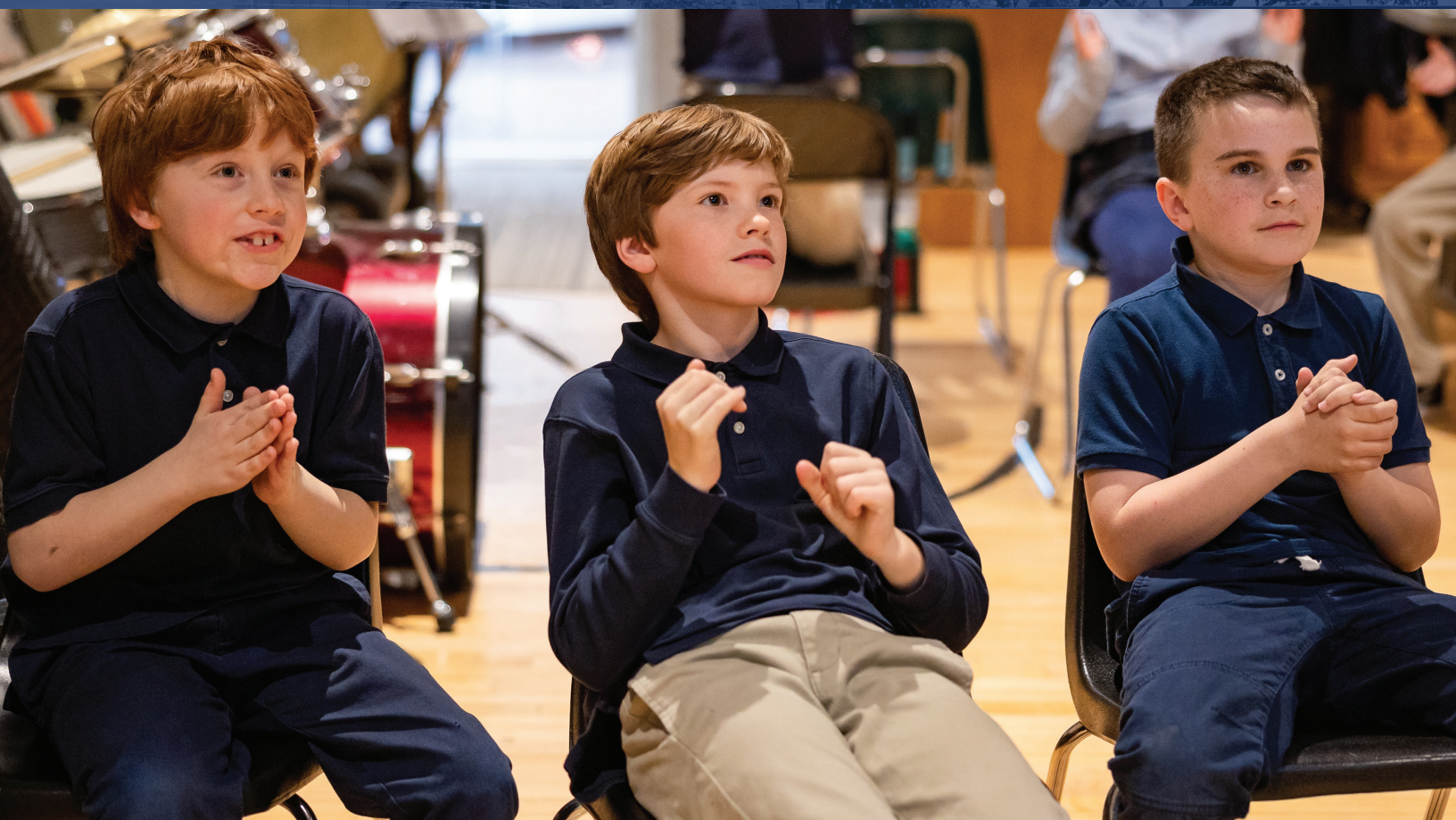
Your support of FMCA has helped to provide an engaging music curriculum as seen on the faces of some of our third-grade students pictured here.